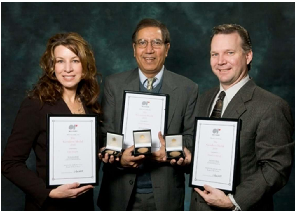
S Kumar, D A Nottestad and E E Murphy

In this case study paper a simulation model is described which enabled a large multi-national manufacturing company (3M) to evaluate the introduction of a product postponement policy that had become feasible. Product postponement involves the timing of products in the various parts of the distribution chain and also whether it is cost-effective to delay some manufacturing processes, e.g. assembly, until a customer order is received. The use of the WITNESS-based discrete-event model enabled distribution planners to evaluate trade-offs between stock holding costs and delivery performance to customers. The judges were impressed with the way that customer ordering behaviour had been modelled in a realistic way and by the development of a decision support tool that enabled the planners to tune the system for best performance and also to investigate what-if scenarios. The model is scalable to include more customers, branches, stock holding units and products and the company now intends to apply the tools to a wider range of products.