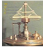
World Organisation of Systems and Cybernetics