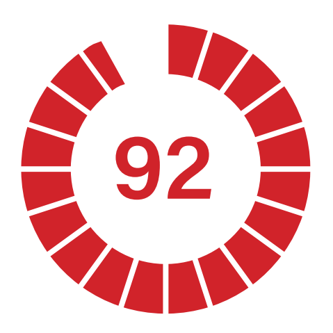
92% delegate satisfaction rate at other OR Society run events*